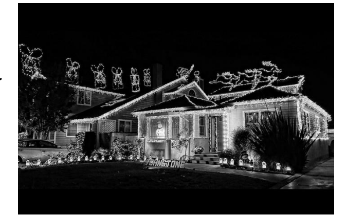
2023 SECOND RUNNER-UP