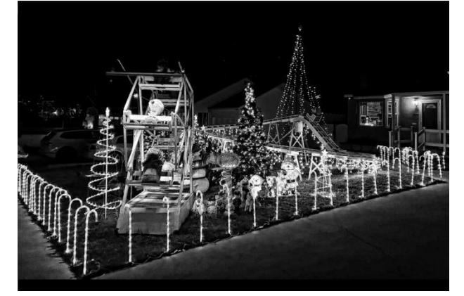
2023 FIRST RUNNER-UP