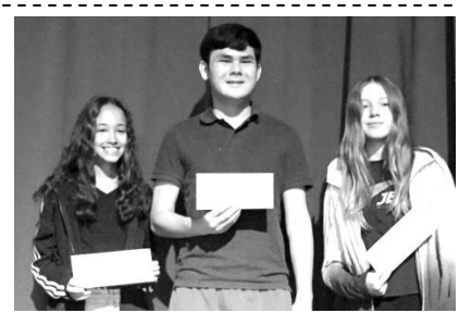
Logo Contest Artists